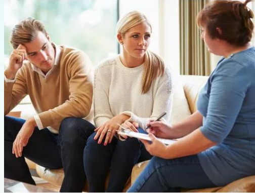
Family Therapy (without patient)