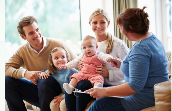
Family Therapy (with patient)